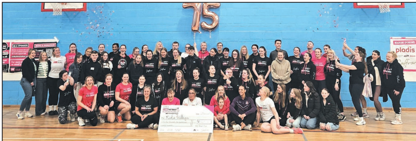
Cheque presentation to The Kids Village just after the marathon was completed.

To use the QR code, simply scan the code in the newspaper with your smartphone through the QR app and the website will be displayed.